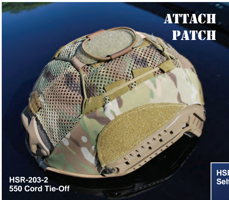
HSR-203-2 550 Cord Tie-Off