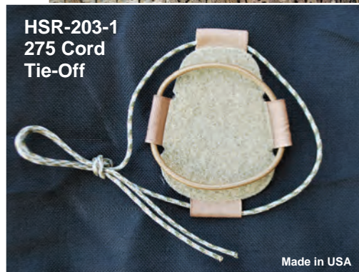
HSR-203-1 275 Cord Tie-Off

Other variations of the HSR-Series Attach Patch have been designed to adapt the HEL-STAR 6 for secure mounting to flat surfaces, vehicles, K-9 harnesses, parachute rigs, and Velcro buckle/straps for attaching to an arm, or leg, If you have a special need, we will do our best to help.